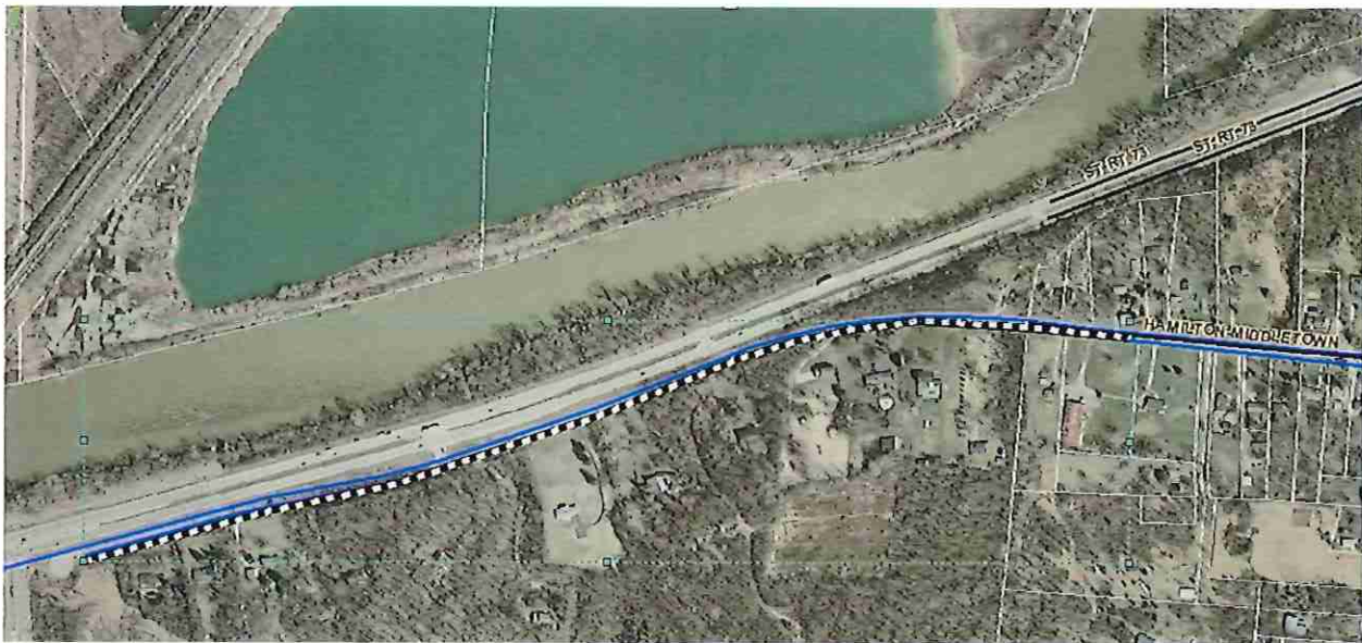
Figure 1 – Riviera Drive Waterline Improvements

WHEREAS, waterline improvements have been constructed by this Board along Riviera Drive as part of the water softening improvements project for the Franklin Area Water Treatment Plant and that these improvements included the installation of 3,900 feet of 6-inch waterline along Riviera Drive from N. Breiel Boulevard in Middletown (Butler County) to 6949 Hamilton-Middletown Road, Franklin Township, shown in Figure 1 ; and